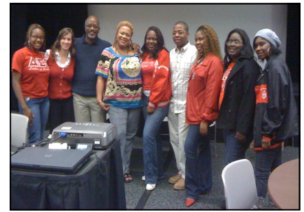
UWF World AIDS day discussion panel participants.